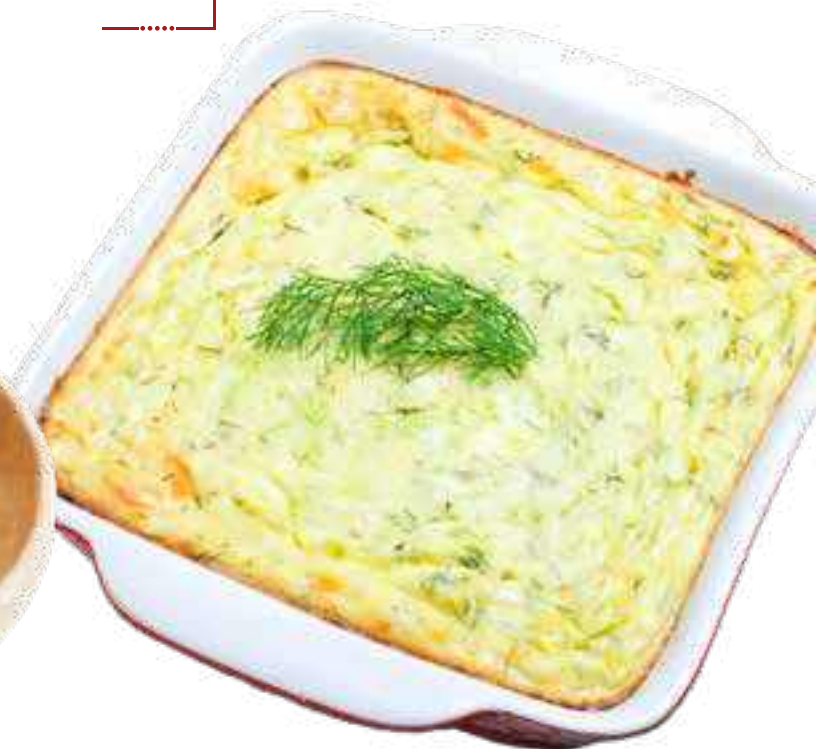
Egg Bake Casserole $3.99/serving