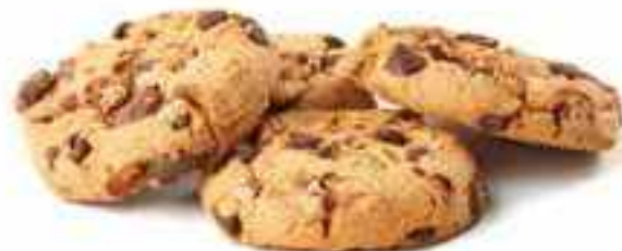
Assorted Cookies $1.99/2 cookies