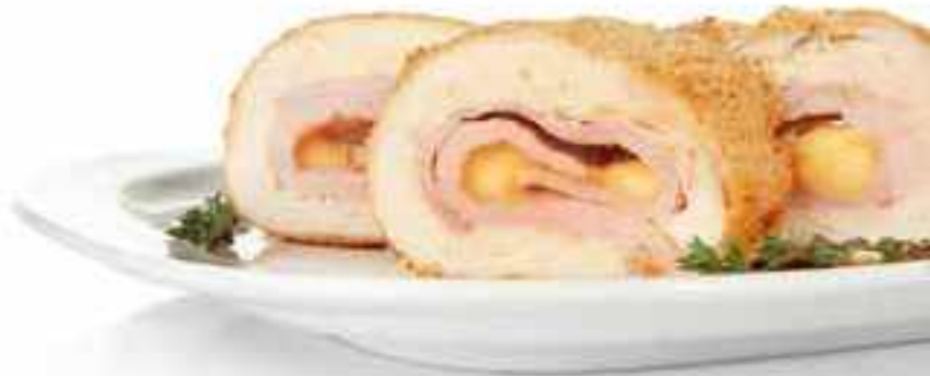
Chicken Cordon Bleu $17.99