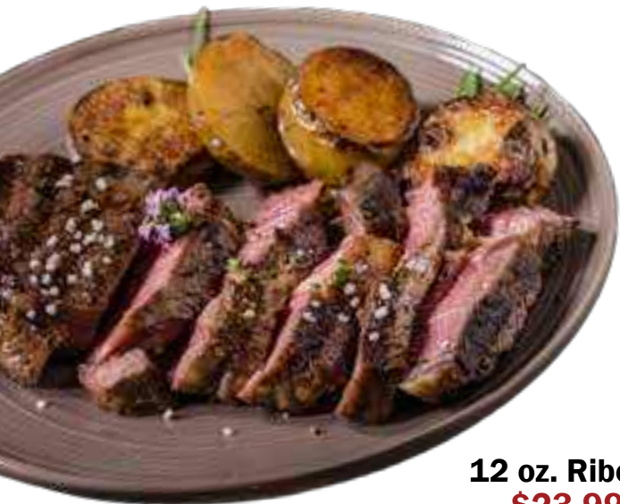
12 oz. Ribeye $23.99

Includes choice of two sides, roll and butter or Texas toast or bread sticks. Table service included. Get single hot entrée for 1/2 of meal price. Add $2.00 for an additional entrée. All prices are subject to change due to market fluctuations.