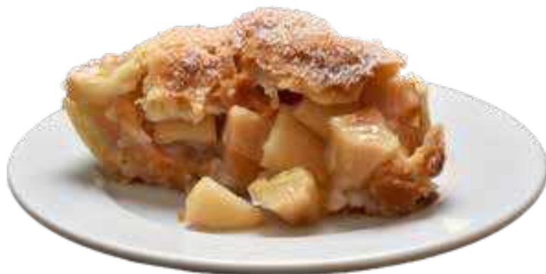
Apple or Pumpkin Pie $3.00/serving