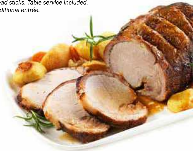
Roast Pork Loin $15.49