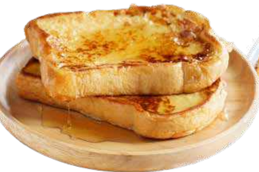
French Toast & Syrup $2.99/serving