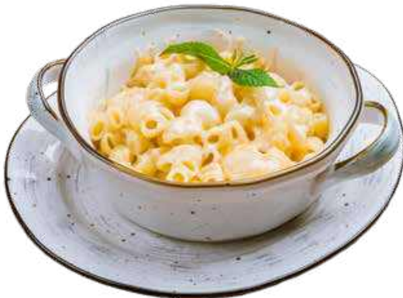
Mac-N-Cheese Appetizer Buffet

Choose any 7 appetizers for $15.99 per guest