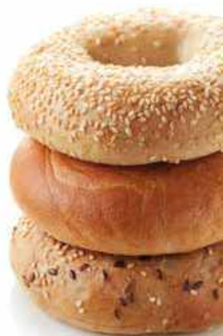
Bagels & Muffins $2.25/serving